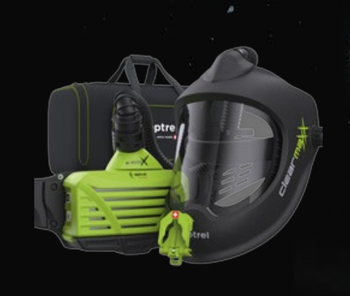
Art.-Nr. 4900.250 optrel Ready-to-Grind Package, consisting of clearmaxx, e3000X, parking buddy and bag