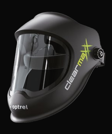
Art.-Nr. 1100.000 optrel clearmaxx standard version