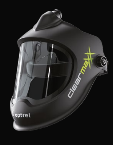
Art.-Nr. 4900.020 optrel clearmaxx PAPR version